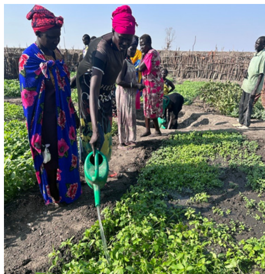
Where agriculture meets entrepreneurship – DRC Farmer Fields Business Schools in Bentiu enhances the capacity of displaced individuals cultivate success from seed to market.

DRC will support 2,000 households, encompassing approximately 12,000 individuals who find themselves in vulnerable situations and lacking access to sufficient food. The initiative strives to provide these households with essential sustenance for a duration of six months, guaranteeing that their fundamental nutritional requirements are adequately fulfilled amidst these trying circumstances. By extending a helping hand, DRC aims to alleviate the hardships faced by these households who are vulnerable and food insecure during this challenging period.