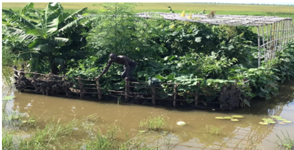
Chinampa Gardens: A Haven of Resilience in Bentiu's Changing Climate.

In essence, DRC's Food Assistance for Assets project in Unity State is not only addressing the immediate needs of the population but also working towards a more sustainable and resilient future. By providing food aid and facilitating asset creation, this initiative aims to empower communities to break free from the cycle of dependence on humanitarian assistance in future.